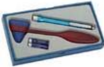
HS-401G15 Gift Series