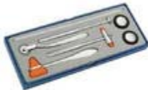
HS-401G10 Medical Gift Series