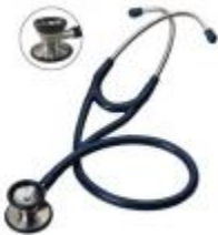
HS-30K Cardiology Stainless Steel Stethoscope

Stainless steel chestpiece makes excellent sound conduction for professional use.