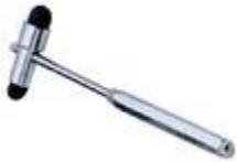
HS-401G3 Fallow Hammer