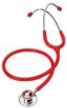
HS-30G Dual Head Professional Stethoscope