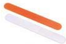
HS-404C Plastic Spatula