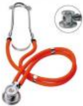
HS-30C Standard Sprague Rappaport Stethoscope

Different spare parts can be used for multiple purpose