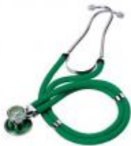
HS-30C1 Coloured Sprague Rappaport Stethoscope