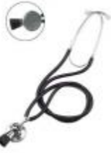
HS-30U Multi-Function Fetal Stethoscope