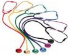
HS-30E1 Coloured Single Head Stethoscope For Child