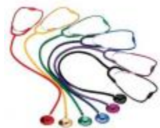
HS-30A1 Coloured Single Head Stethoscope For Adult