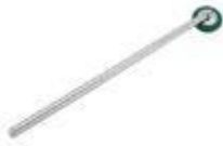
HS-401G7 Hammer with telescopic handle