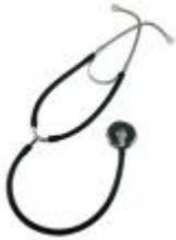
HS-710 Single Head Stethoscope With Special Membrane