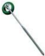
HS-401G5 Gristle Hammer