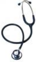
HS-30L Dual Head Deluxe Stethoscope For Adult