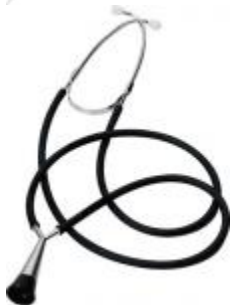
HS-30T1 Standard Fetal Stethoscope

Conoid chestpiece is designed exclusively for fetal field closely.