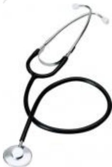
HS-30A Single Head Stethoscope For Adult

We also provides various stethoscopes with given functions for different use. Moreover we are glad to develop new product to meet request of customers from all over the world.