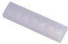
HS-404A Bar-shape Medicine Box