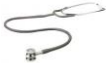
HS-30R2 Stethoscope For Neonate And Baby