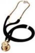
HS-30C2 Golden Sprague Rappaport Stethoscope