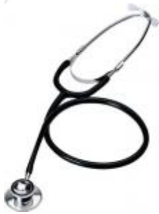
HS-30B Dual Head Stethoscope For Adult