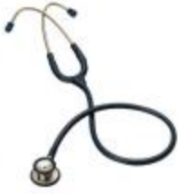
HS-30H Stainless Steel Stethoscope For Child