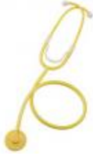
HS-30D Disposable Stethoscope