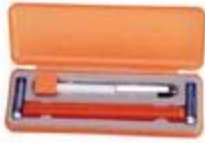
HS-401F3-B Medical Gift Series