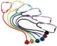
HS-30F1 Coloured Dual Head Stethoscope For Child