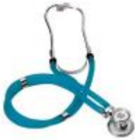
HS-30C4 Transparent Sprague Rappaport Stethoscope