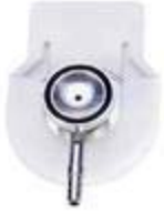
HS-400 Stethoscope Base