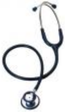
HS-30M Dual Head Deluxe Stethoscope For Child