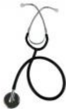
HS-711 Standard Single Head Stethoscope With Special Membrane