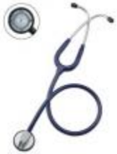
HS-30V Cross Membrane Lock Stethoscope

The frequency stethoscope features a tunable diaphragm that allows the user to conveniently alternate between bell and diaphragm modes by applying simple pressure on the chestpiece without turning over the chestpiece.