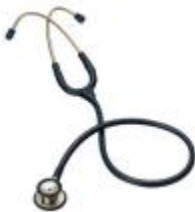
HS-30J Stainless Steel Stethoscope For Adult