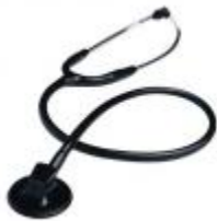
HS-30P Professional Single Head Stethoscope