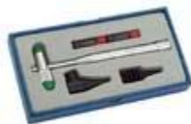
HS-401G13 Medical Gift Series