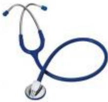
HS-30N Deluxe Single Head Stethoscope