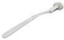
HS-401G10A Gristle Hammer