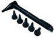
HS-402 General Optic Oscope