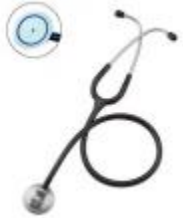
HS-30W Frequency Adjustable Single Head Stethoscope