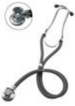
HS-30C3 Clock Rappaport Stethoscope