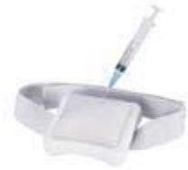
HS-403E Training Pad for injection